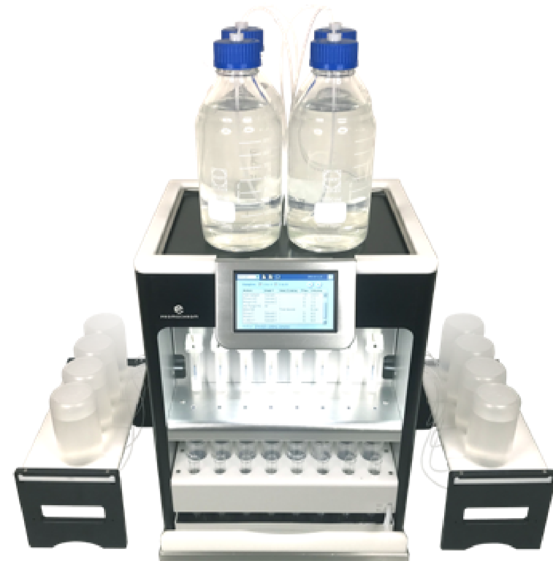
Fig 2. SPE-03 with closed sample loading set up and shortened sample tubing.